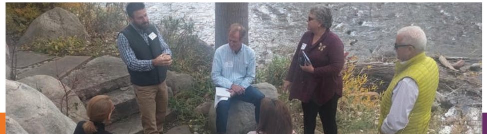
The new Arts & Culture Funders Group (top) recently met in Denver, Colorado Springs, and Fort Collins, while the RFLN had its first convening in Basalt at the Aspen Community Foundation (above).

A core group of member foundations have invested in the creation of a network structure aimed at better serving the needs of rural communities and addressing pressing challenges in rural Colorado. With the hiring of a full-time director in late 2018, the Rural Funders Learning Network began convening regularly for active peer learning, networking, and sharing of information. Goals also include: identifying innovative approaches and funding strategies, while fostering partnership opportunities among funders. There is also the opportunity for funders to work together on the larger, systemic issues affecting rural Colorado. All funders are invited to participate in the effort, which is guided by an advisory committee that meets frequently and includes leaders from Aspen Community Foundation, Boettcher Foundation, Caring for Colorado Foundation, The Colorado Health Foundation, The Colorado Trust, Delta Dental of Colorado Foundation, Donnell-Kay Foundation, Gates Family Foundation, Great Outdoors Colorado, Orton Family Foundation and Telluride Foundation. In late October, Aspen Community Foundation hosted the first official network convening in Basalt, which featured learning about key data on the region and lessons learned on ACF’s Cradle to Career initiative. A webinar in December attracted dozens of members wanting to learn more about how to play a role in supporting new Opportunity Zones.